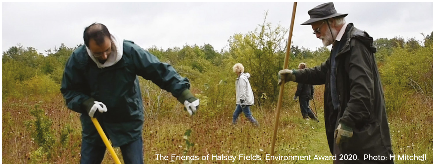
The Friends of Halsey Fields, Environment Award 2020.