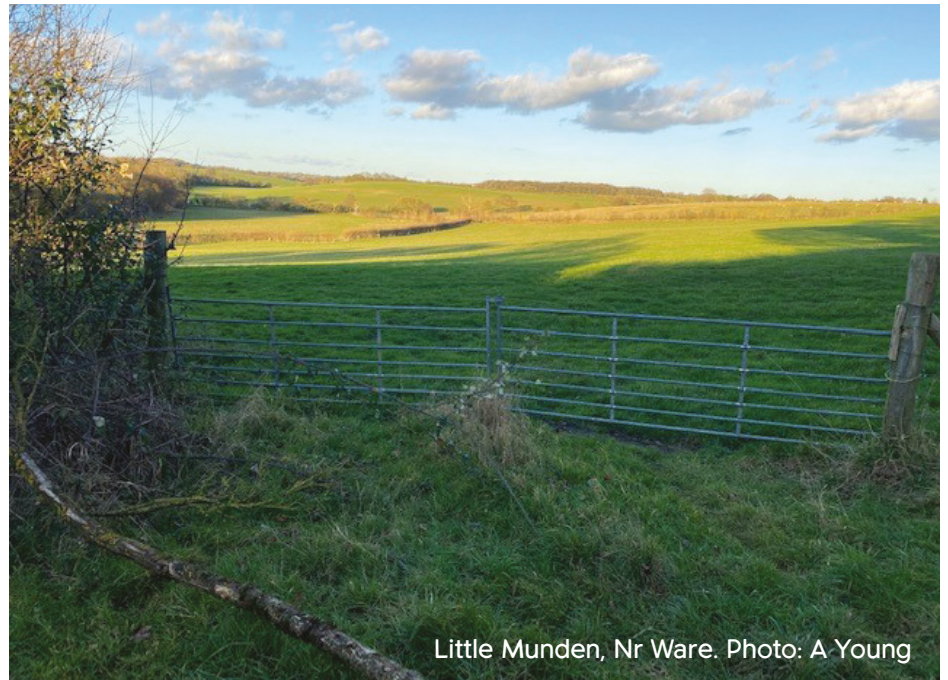
Little Munden, Nr Ware.

Personally, I have found that I love living in the countryside – despite it being a big change from growing up in North London and then living in a Hertfordshire market town. I love the activity of the farming calendar and the rural traditions where I live, and the countryside provides me with a place to walk and to wind down after a busy day, or to prepare mentally for a busy day ahead. I love that it is a complete contrast to my busy working life and that it isn't neat and ordered and clean, but actually wild and scruffy and even sometimes a little smelly! It's dark at night and teeming with life and activity during the day. Everywhere you look there is movement – farming activity; birds in the hedgerows and