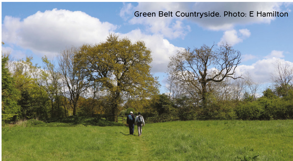
Green Belt Countryside.