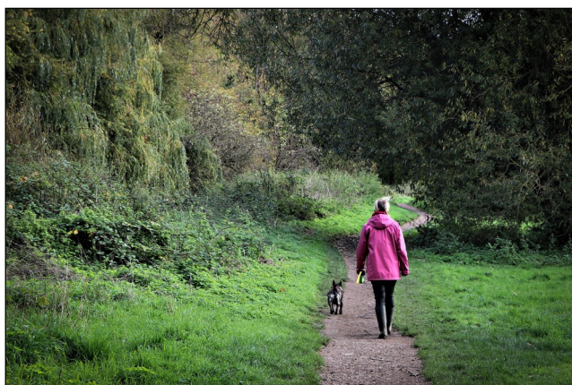
In the Sopwell Nunnery Green Space, just to the south of St Albans on our Ver Valley and Bricket Wood walk

All of our walks are available to view and download on our website www.cpreherts.org.uk