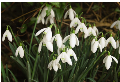
Snowdrops, a harbinger of spring

Your membership helps us to work towards our aim to protect, promote and enhance Hertfordshire's countryside for everyone's benefit. Membership is from £3 per month, but giving at a higher level will enable us to do more.