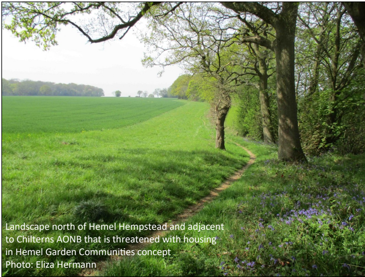
Landscape north of Hemel Hempstead and adjacent to Chilterns AONB that is threatened with housing in Hemel Garden Communities concept

Empowering communities to protect and improve their local environment